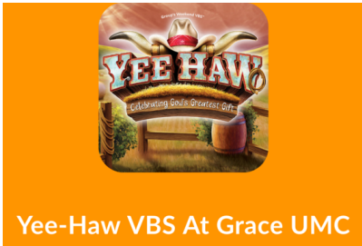
Yee-Haw VBS At Grace UMC